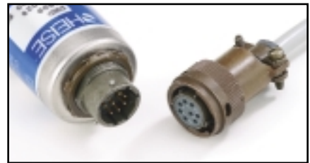
Optional – ITT Cannon kPT07 receptacle with kPT06 mating connector (Bendix PT07/PT06 compatible)