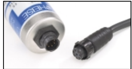
Standard – Switchcraft EN3, 8 pin weather-tight receptacle and mating connector